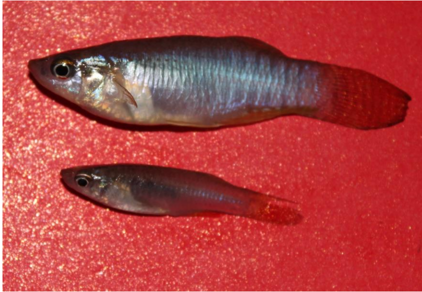
Fig. 1: Male (above) and female (below) specimens of the mangrove topminnow, Aplocheilichthys spilauचना