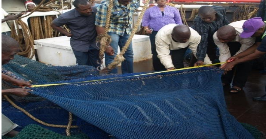
Plate 1: During measurement of single flap cover.

The entire flap cover observed in 2013 was single cover but 100% usage of double flap cover was observed in the industry in 2015.