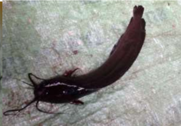
Plate 2: Clarias agboyiensis