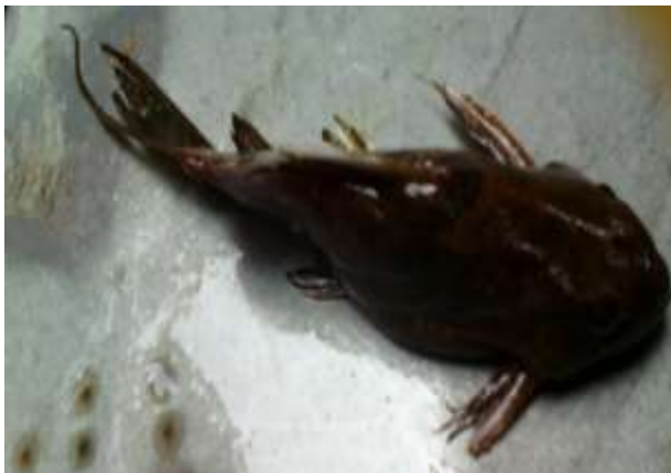
Plate 1: Synodontis clarias

Samples were collected and dissected to remove gills, liver and gonad samples. The gills were collected by opening the operculum of the fish samples. The liver and gonad samples were dissected out of the fish through the ventral side. The fish samples were bought from fish landing sites at Lekki and Epe and identified at the Marine Biology Section of the Institute of Oceanography. Ten specimens each of Clarias agboyiensis and Synodontis clarias were used for the study. Standard length of the samples was taken using a graduated ruler while body weight was measured using a balance. Fish specimens were sourced from four sampling stations.